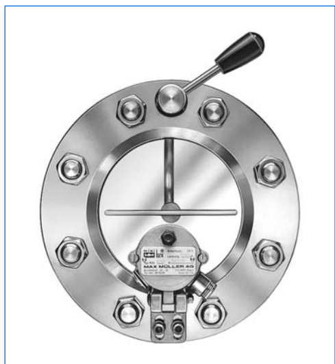
Wiper system WS, built into a VETROLUX® sight-glass to DIN 28120, DN 100, PN 10, with mounted sightglass light fitting miniLUX®, type KVL 50 HDSch, 24 V, 50 W, for combined “view and light through one assembly”.

As a complete set with detailed mounting instructions to be built into existing sightglasses or supplied together with a complete sightglass VETROLUX® to your specifications. In the second case, MAX MÜLLER AG carries out the necessary machining of the welding and the cover flange of the sightglass.