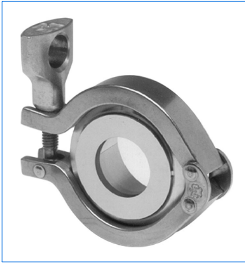
Metal fused Triclamp sanitary sightglass fitting