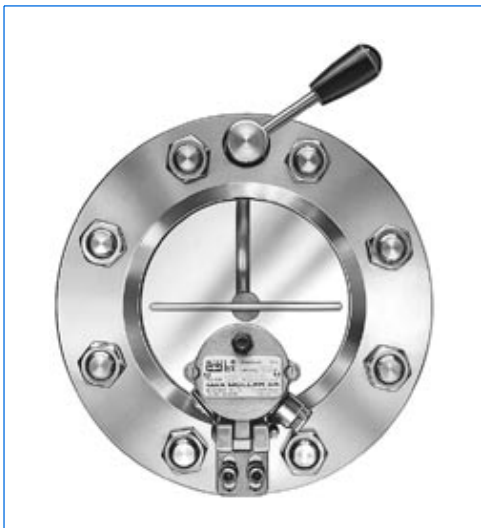
Wiper system WS, built into a VETROLUX® sight-glass to DIN 28120, DN 100, PN 10, with mounted sightglass light fitting miniLUX®, type KVL 50 HDSch, 24 V, 50 W, for combined “view and light through one assembly”.

As a complete set with detailed mounting instructions to be built into existing sightglasses or supplied together with a complete sightglass VETROLUX® to your specifications. In the second case, MAX MÜLLER AG carries out the necessary machining of the welding and the cover flange of the sightglass.