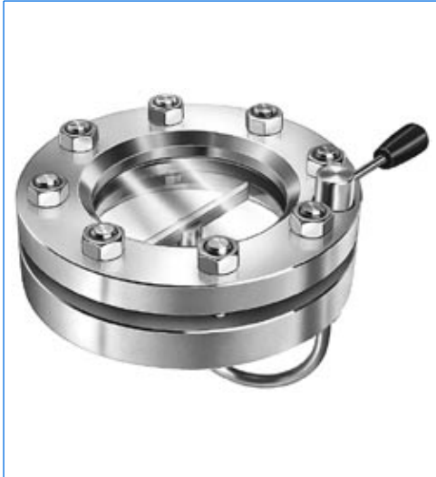
Wiper system WS, built into a VETROLUX® sight-glass to DIN 28120, DN 100, PN 10.