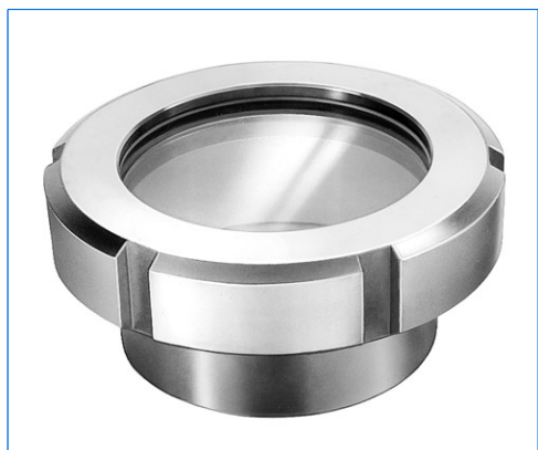
Screwed sightglass, DN 100, PN 6, type SSA 100