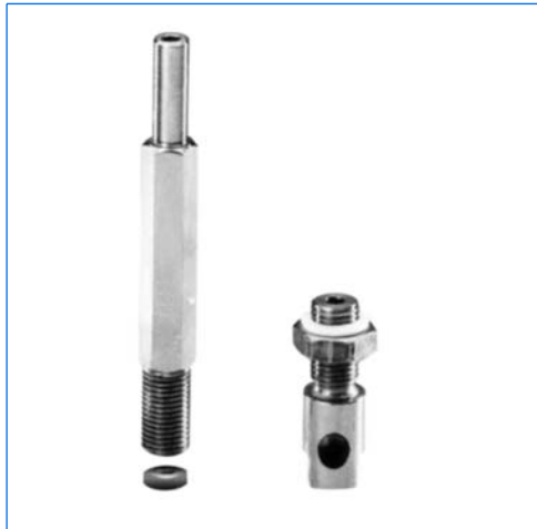
Spraying unit of the series SVS